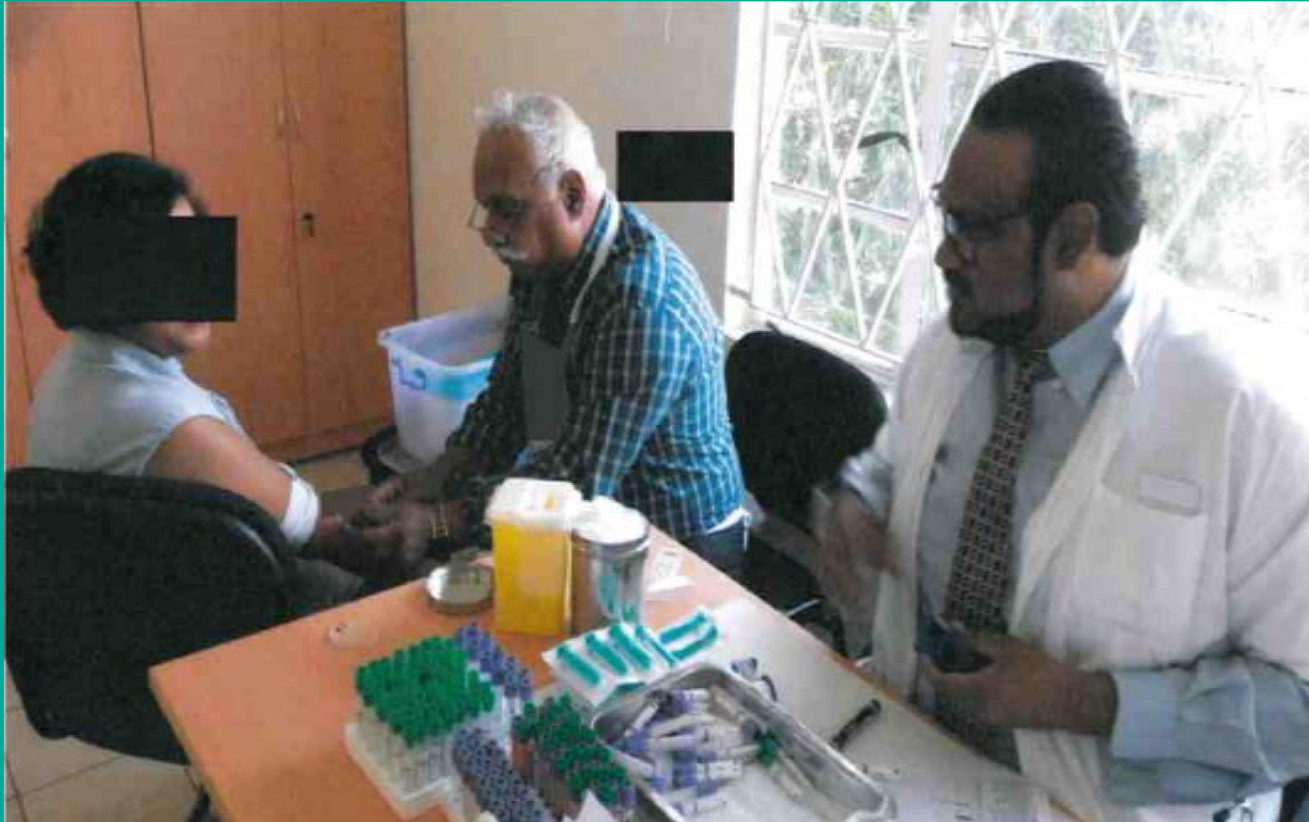
Laboratory Blood Sampling for full analysis