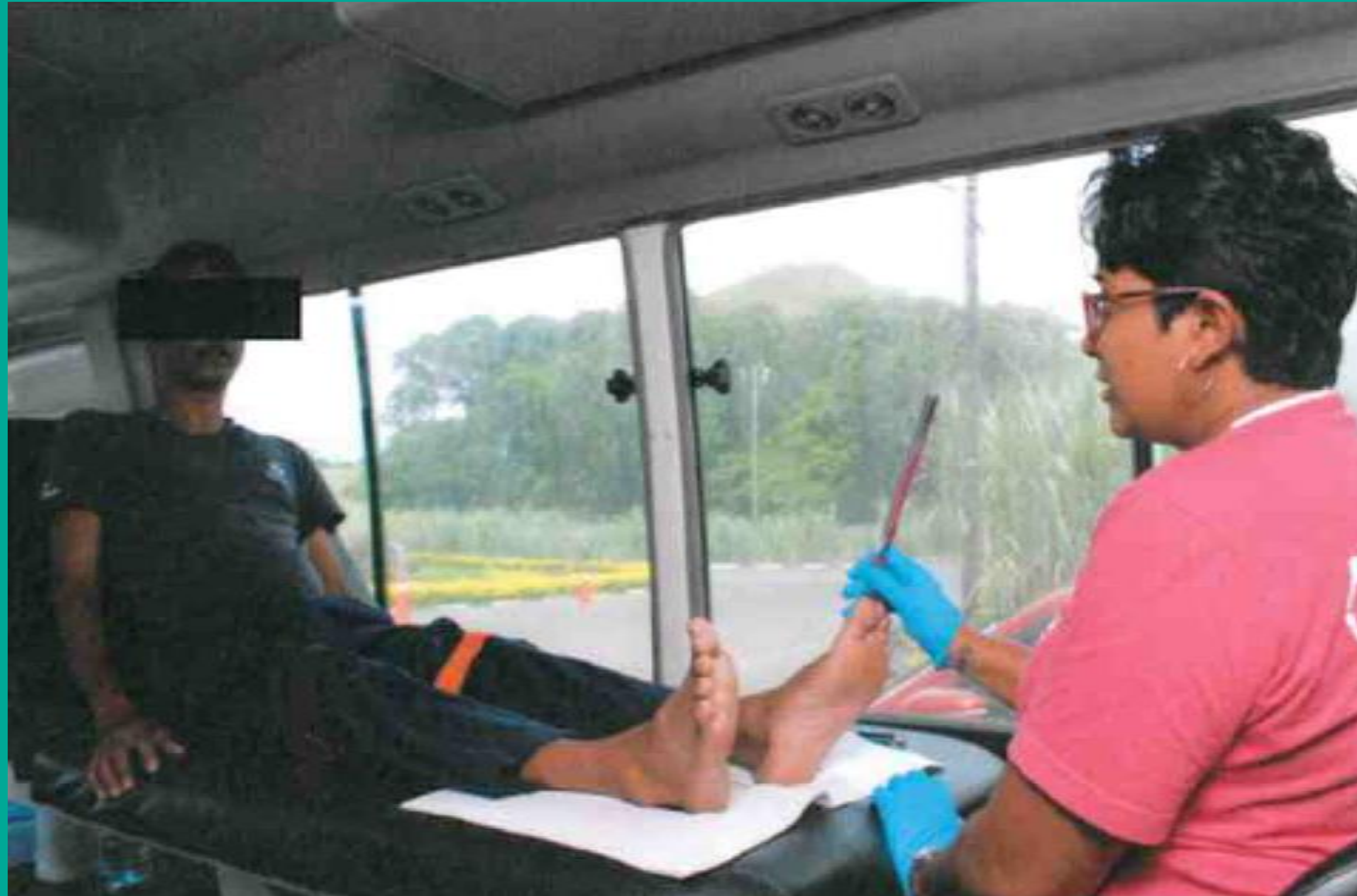
APSA Foot Care Caravan