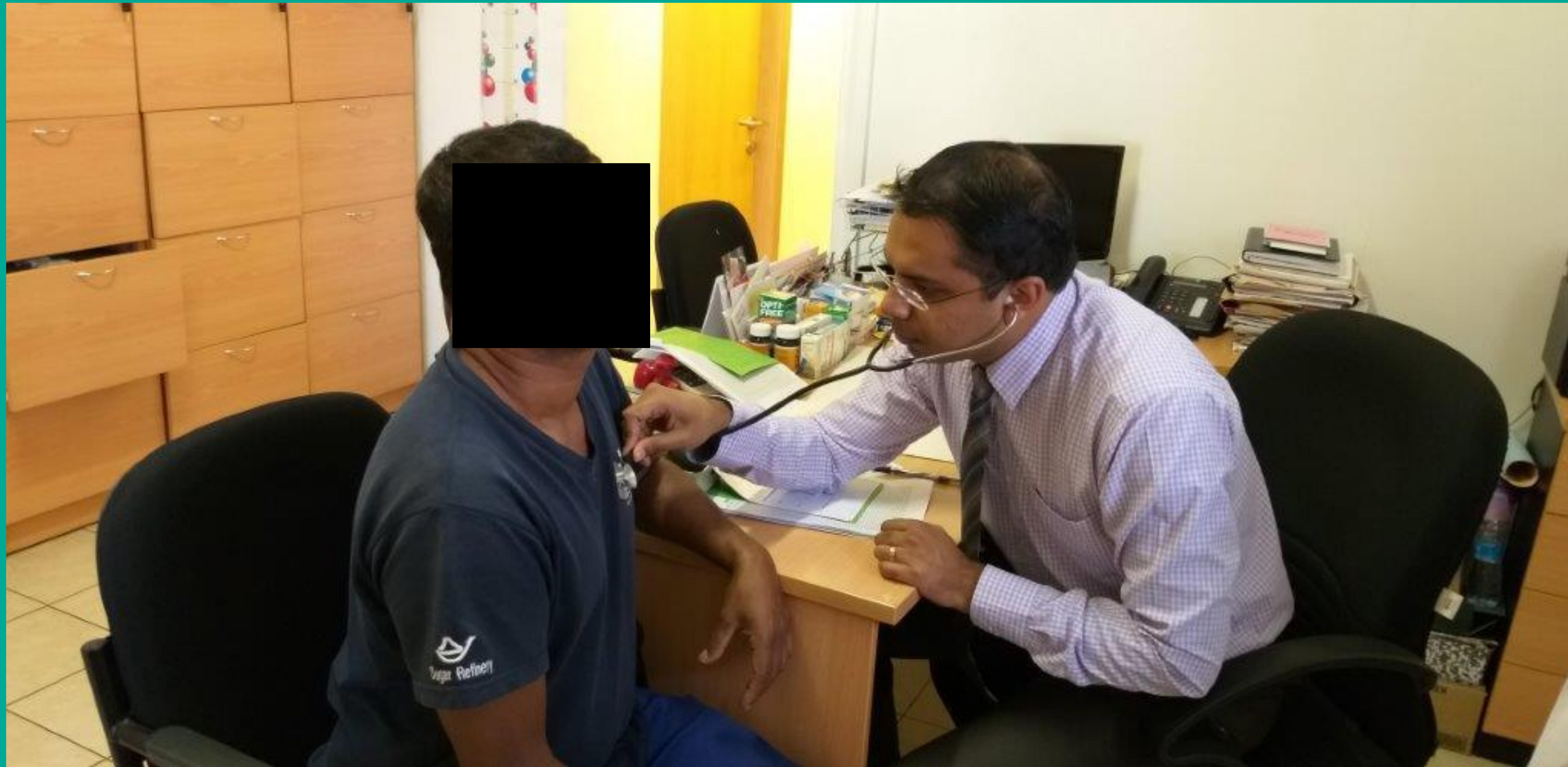
Examination by Cardiologist