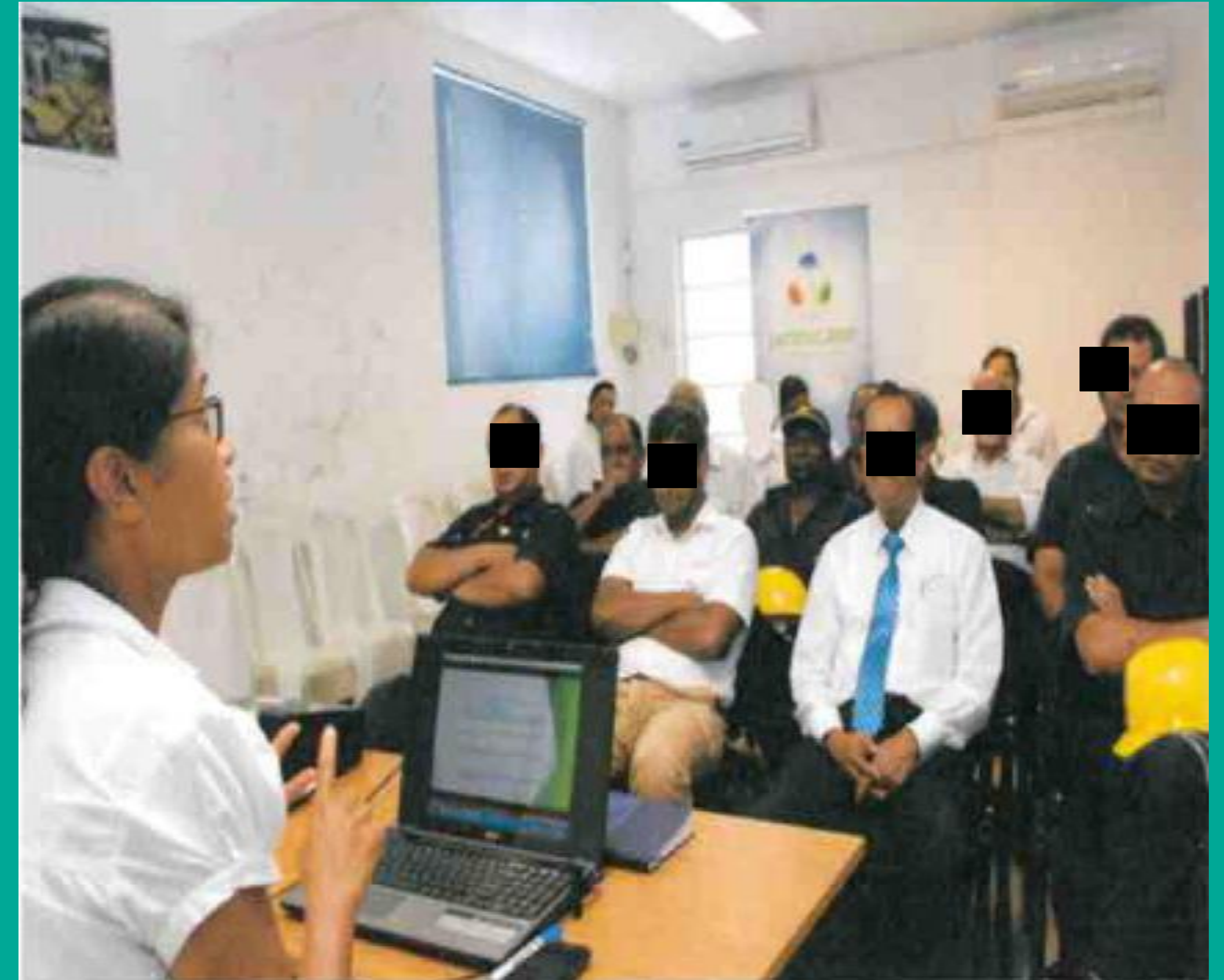
Counselling sessions on Nutrition