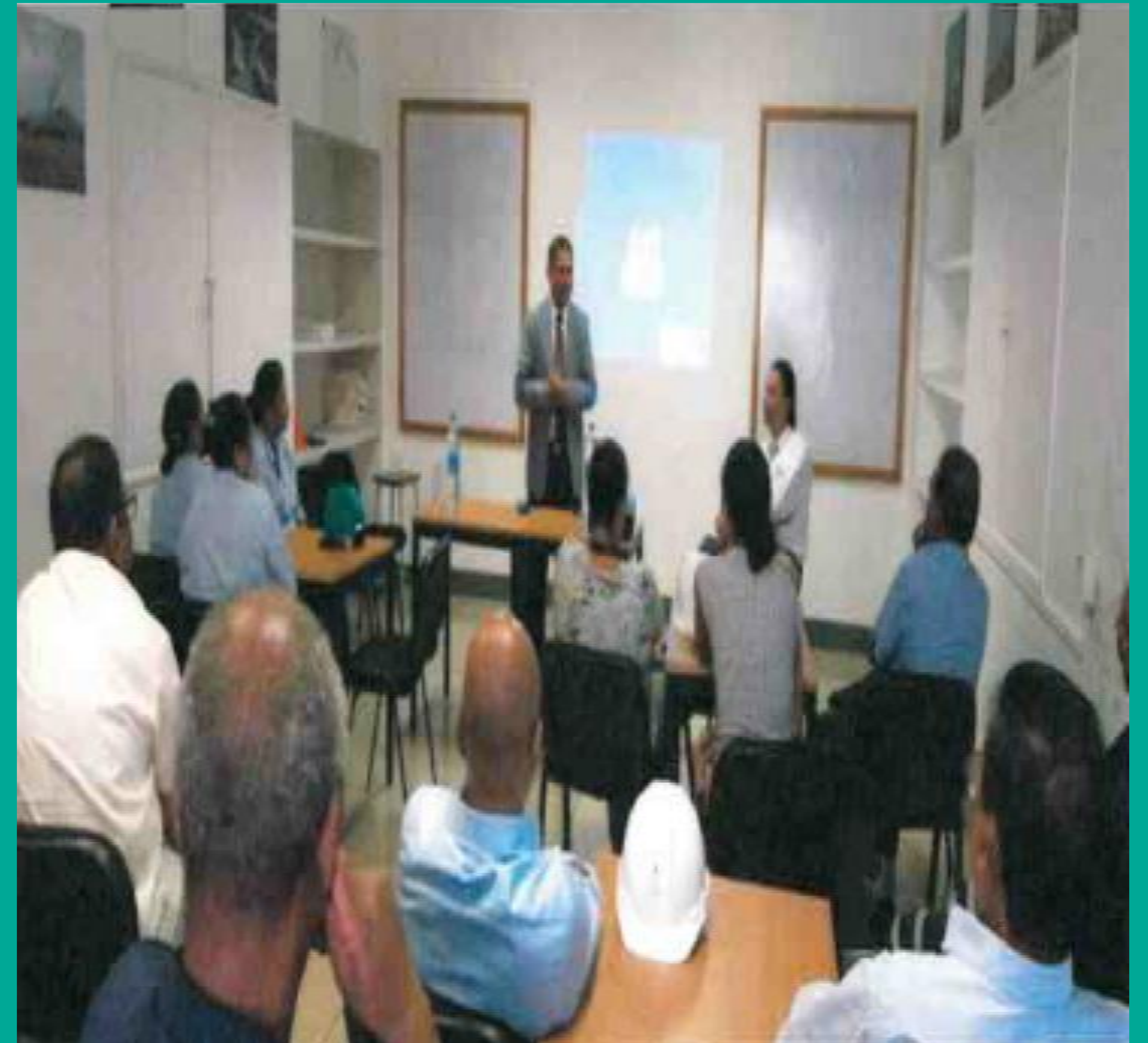
Counselling sessions on Stress Management